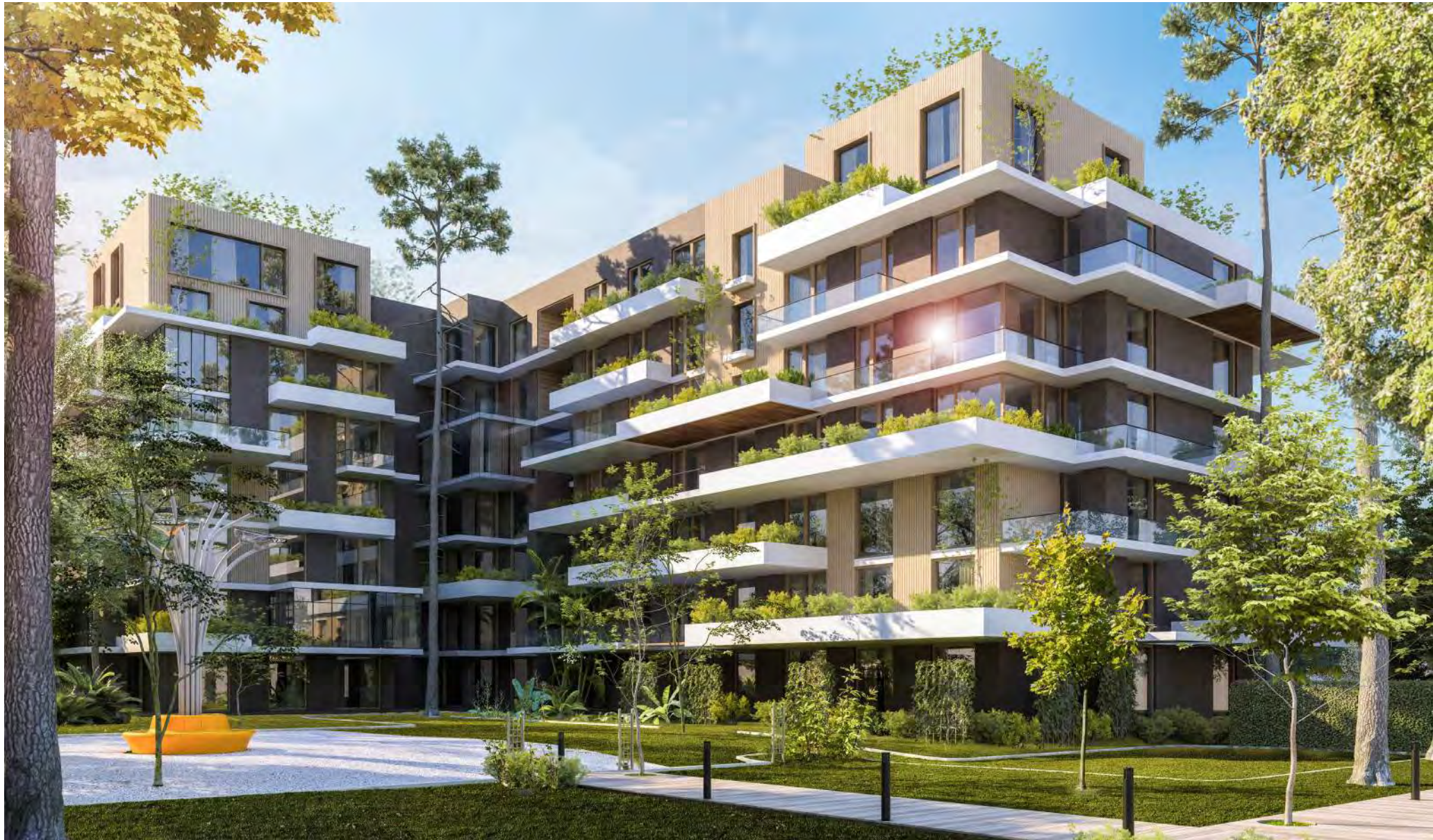
APARTMENTS & PENTHOUSES